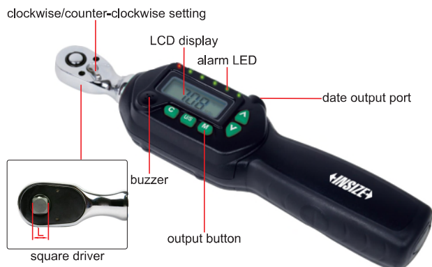
IST-17W12A type A

TYPE B OPTIONAL ACCURACY: CLOCKWISE: ±1% COUNTER-CLOCKWISE: ±2%